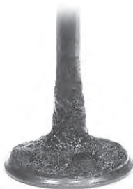
Intake Valve before P.i. Treatment