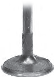
Intake Valve after P.i. Treatment