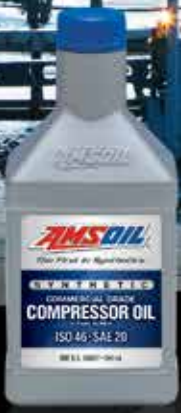
SYNTHETIC COMPRESSOR OIL