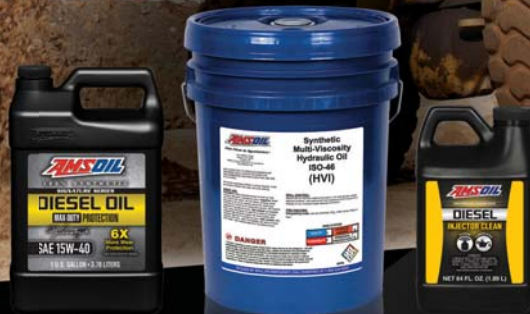
SYNTHETIC DIESEL OIL